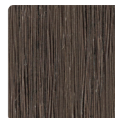
REF. 536 RAL ± 8028 COFFEE