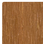
REF. 535 RAL ± 8024 TEAK

Refined design with a shadow gap; creating the visual rhythm of open cladding, without structural or maintenance drawbacks.