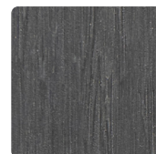
REF. 537 * RAL ± 7016 DARK GREY